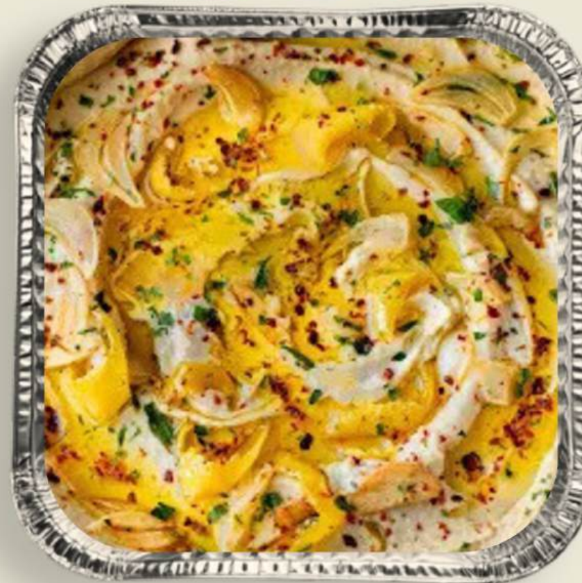
HUMMUS BEIRUTY + EXTRA VIRGIN OLIVE OIL