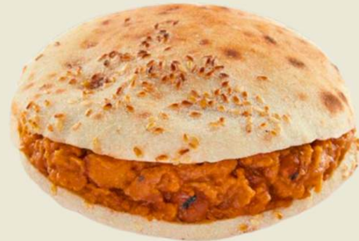
FAVA BEANS PITA