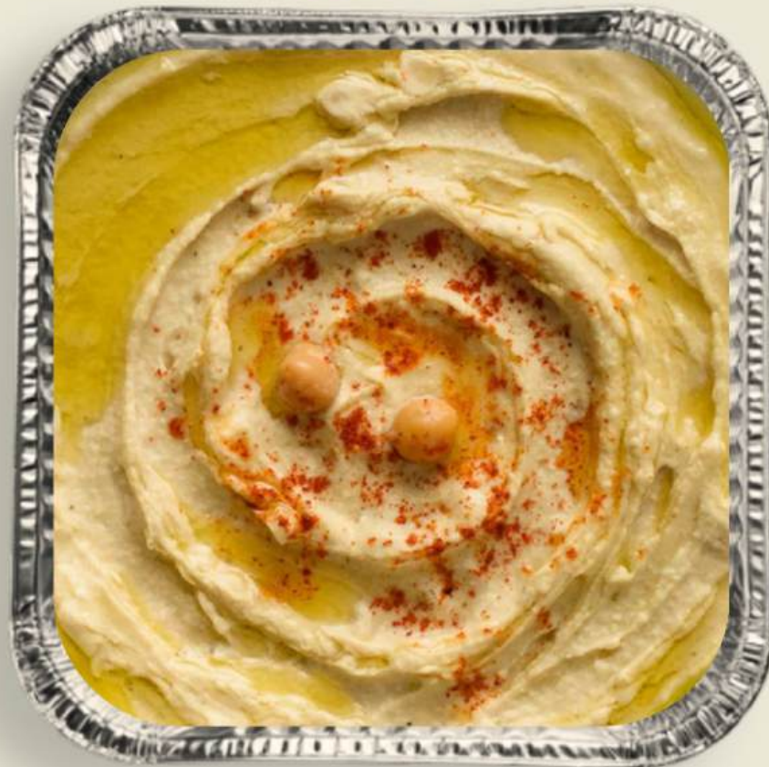
HUMMUS + EXTRA VIRGIN OLIVE OIL