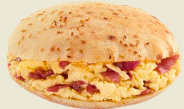
EGG PASTRAMI PITA