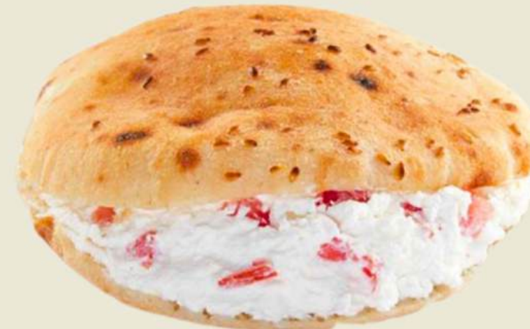
WHITE CHEESE & TOMATO PITA