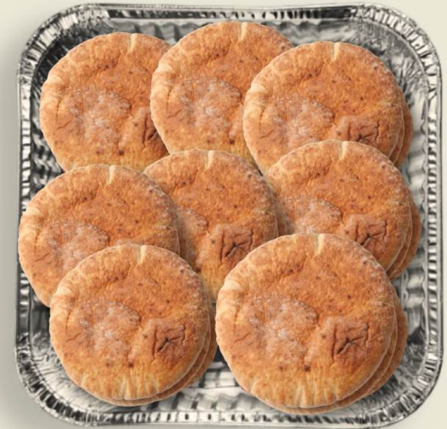
PLATE OF 10 HOMEMADE PITA BREADS