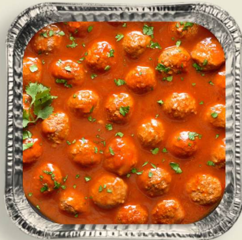
EGYPTIAN KOFTA IN RED SAUCE