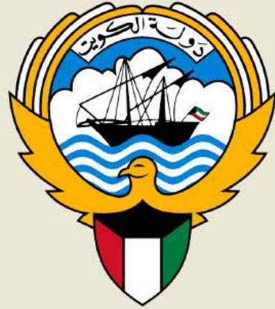
Kuwait Embassy London