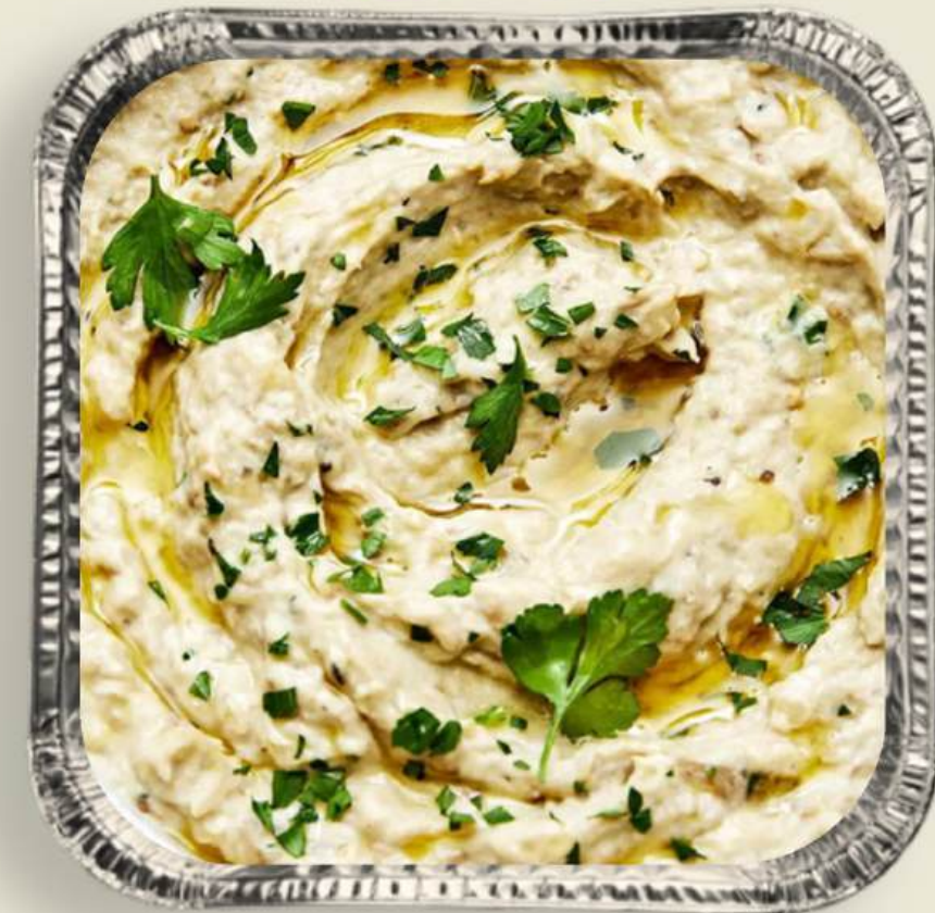
BABAGANOUSH + EXTRA VIRGIN OLIVE OIL