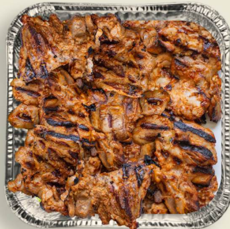
CHARGRILLED CHICKEN SHISH THIGHS