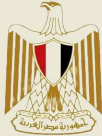
Embassy of Egypt London