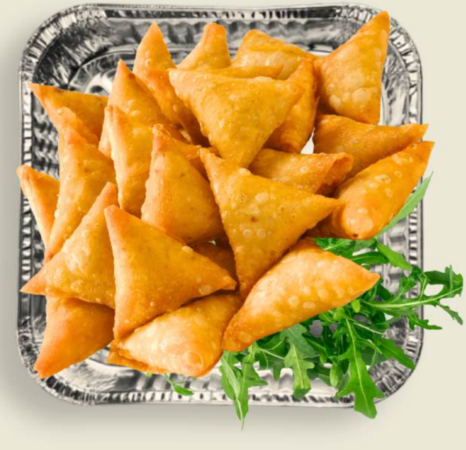
SAMOSAS (LAMB, CHICKEN OR VEG)