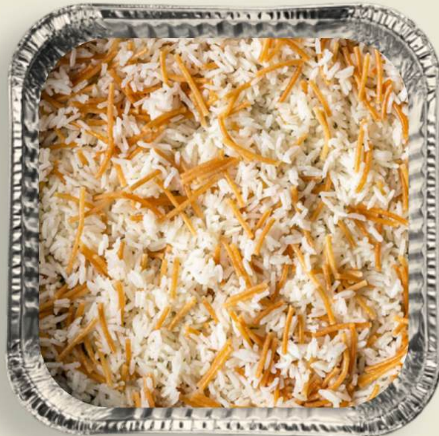
EGYPTIAN VERMICELLI RICE